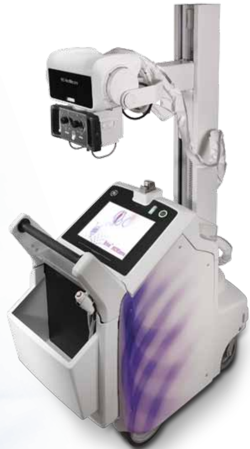
Brivo* XR285amx Just what you need.

Enjoy the freedom to upgrade to a fully integrated mobile solution on your schedule.