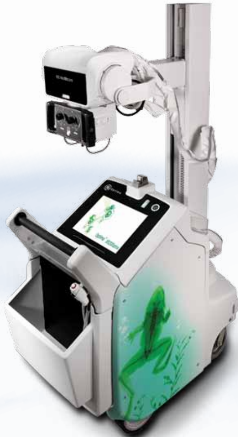
Optima XR200amx Digital-ready when you are.

Enjoy the freedom to upgrade to a fully integrated mobile solution on your schedule.